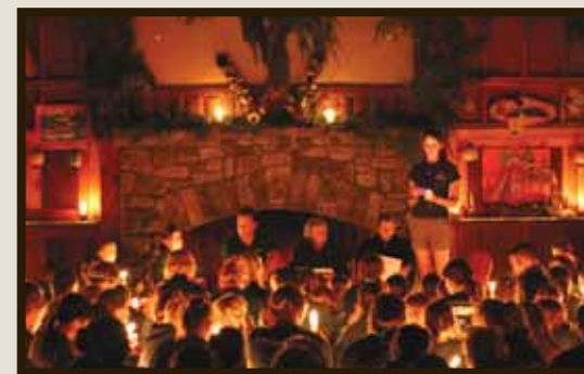
Most of you have experienced our Candlenight Ceremony on the water, in canoes. This year wind and rain forced us inside to enjoy the traditional camp ceremony in front of the Intermediate Wiggie Fireplace.