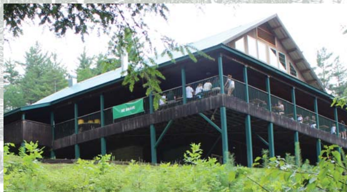
Cobb Dining Hall

Wyonegonic Camps, 215 Wyonegonic Rd, Denmark, ME 04022 wyonegonic.com • info@wyonegonic.com • 207-452-2051