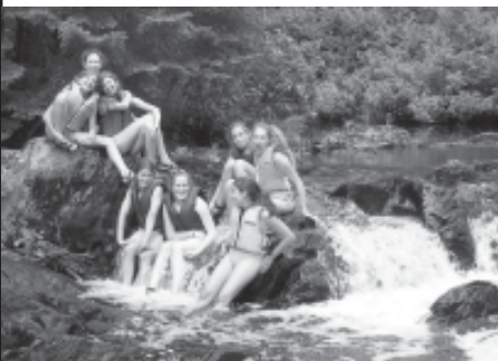
Time out to enjoy the stream.