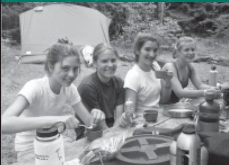
Time for a meal after a day of paddling on the Allagash River.