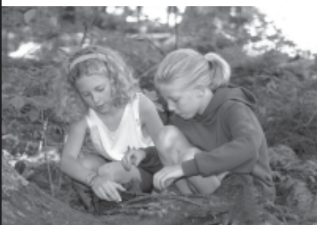
Ecology class - exploring the wonders in Wyonegonic's backyard.