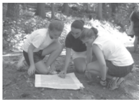
Maine Woodsman, learning how to read maps and chart their course.