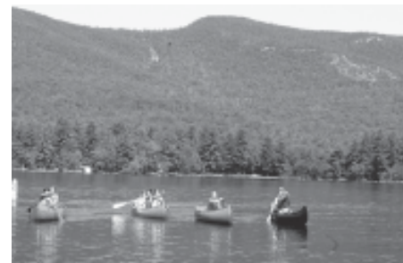
Canoe Class with Pleasant Mountain.