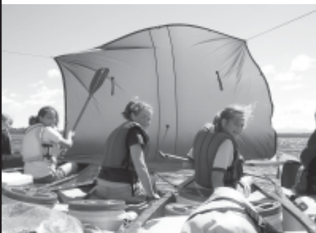
Seniors sailing their canoes on the West Branch of the Penobscot.