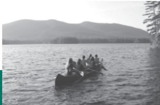
CITs in the war canoe, heading for the mountain.