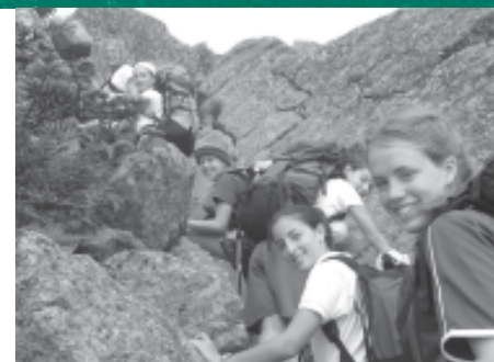
Hiking to an AMC hut.