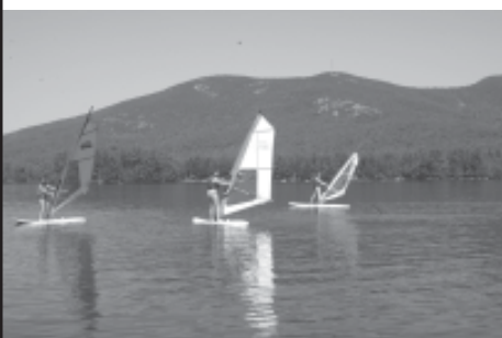
Sailboarding, a popular challenge for Senior Campers.