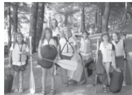
Juniors packed up for cabin overnight.