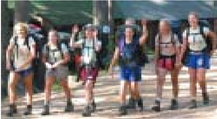
Triumphant and happy Wilderness Hikers walking through camp after their 3 week hike on the AT.