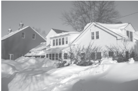
Sudduth farmhouse - Wyonegonic winter office

We are still peeking from behind huge piles of snow, built up by extraordinary winter storms that came whisking across Moose Pond in December, January and February. Even though we love winter, the change of season, and skiing, there was one snow flake too many in Denmark this winter.