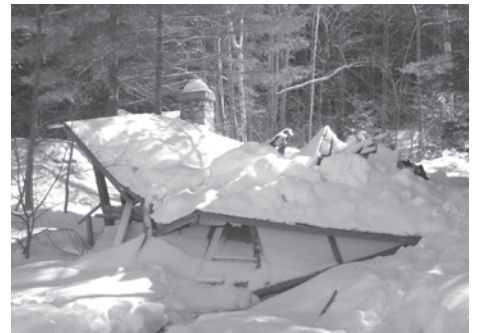
Junior Wiggle - February 2008