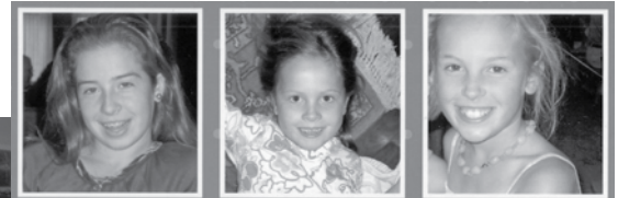
The Elliott girls