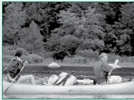
CIT's paddling by moose