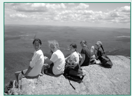
Lunch stop with a view