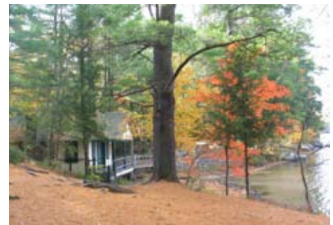
Junior Wiggle - October 2007