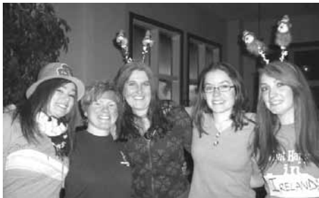
St. Paddy's Day in British Columbia