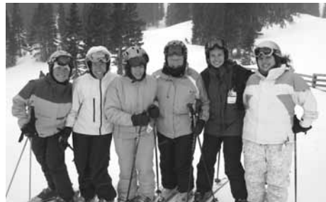
Ski Slope Reunion