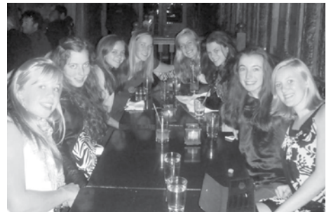
16th Birthday Party