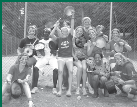
4th of July wake up call