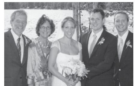
The Wescott Family