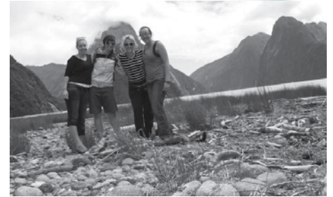
Four Hikers in New Zealand