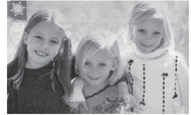
The Walters Girls